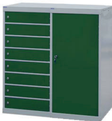
8 Compartment Locker 8 Door / Single Door