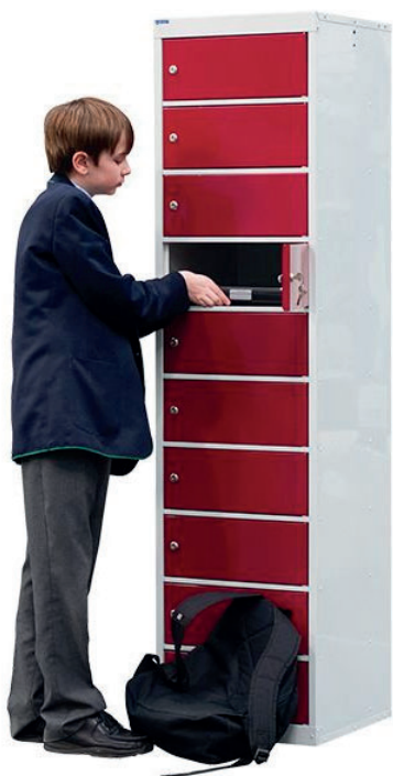
10 Compartment Locker - 10 Door