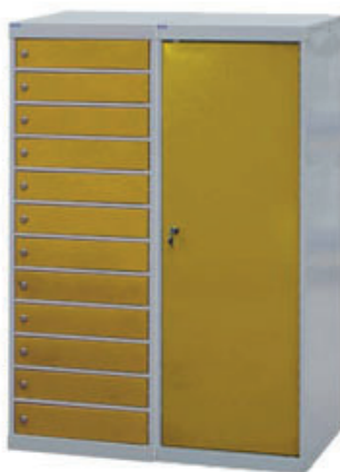
12 Compartment Locker 12 Door / Single Door